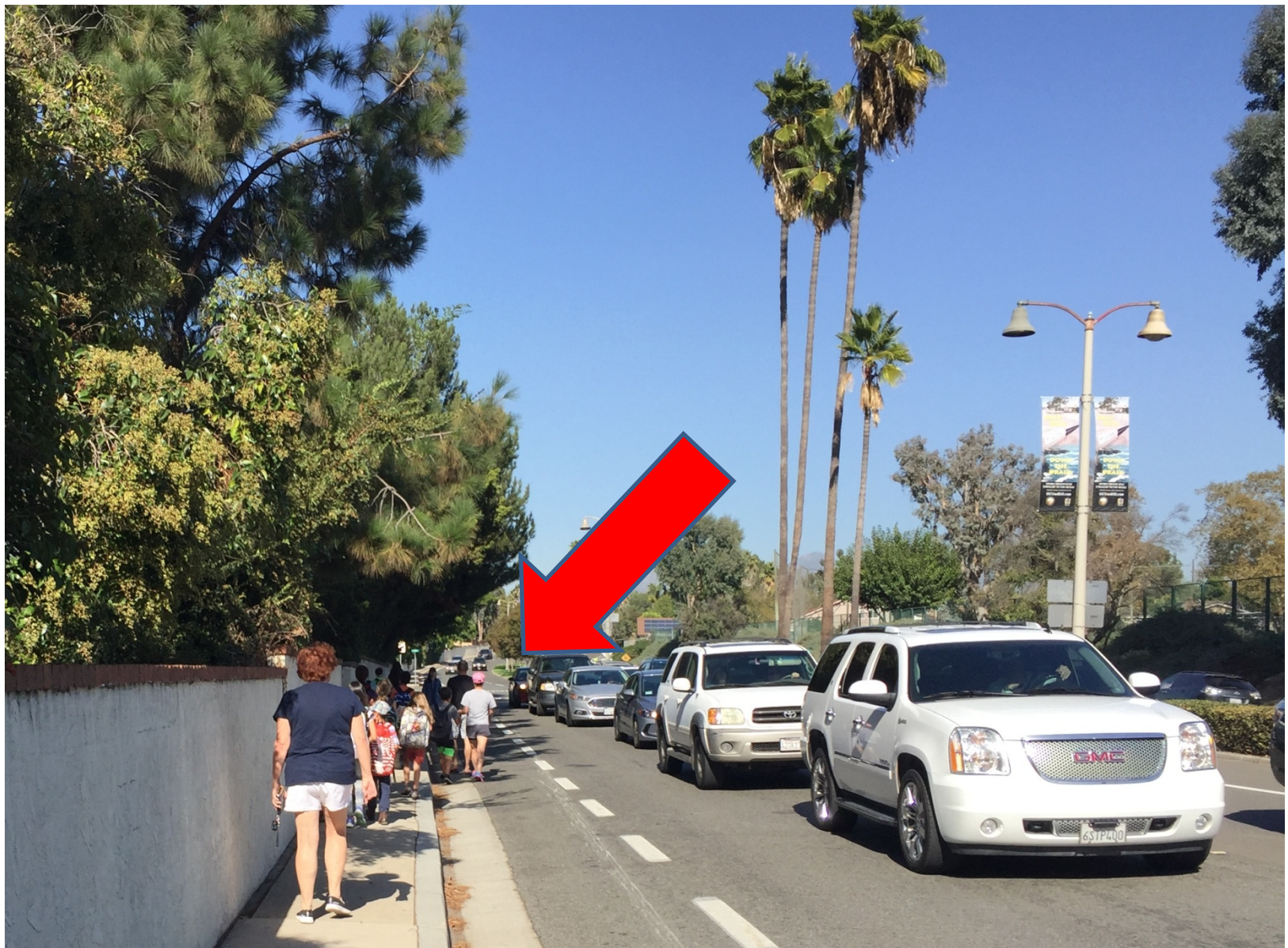
Pedestrian Walking in Street