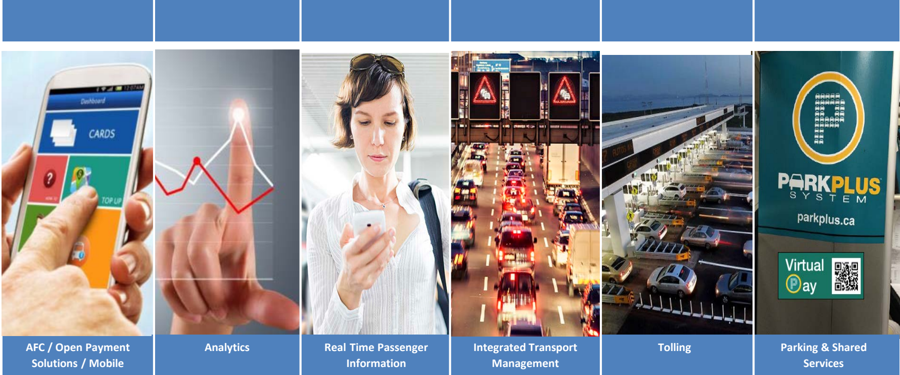
AFC / Open Payment Solutions / Mobile