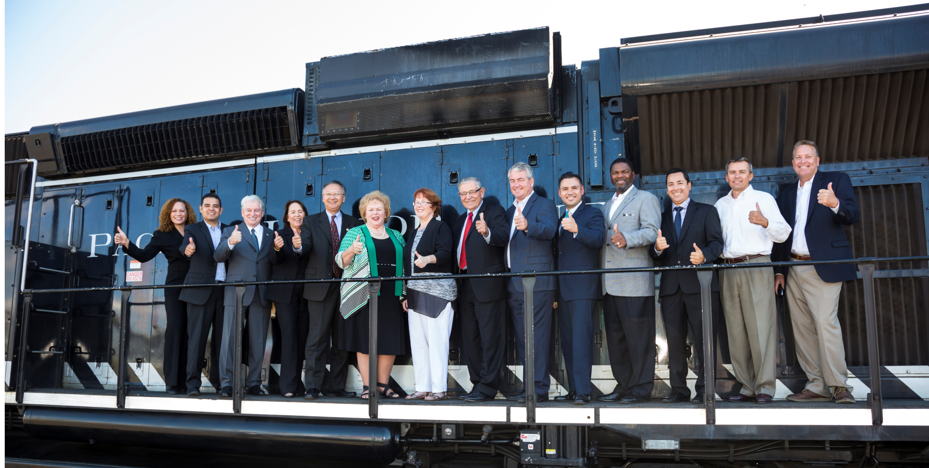
Substantial Completion - March 2015