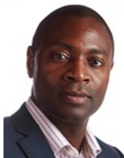
Darnell Grisby Commissioner