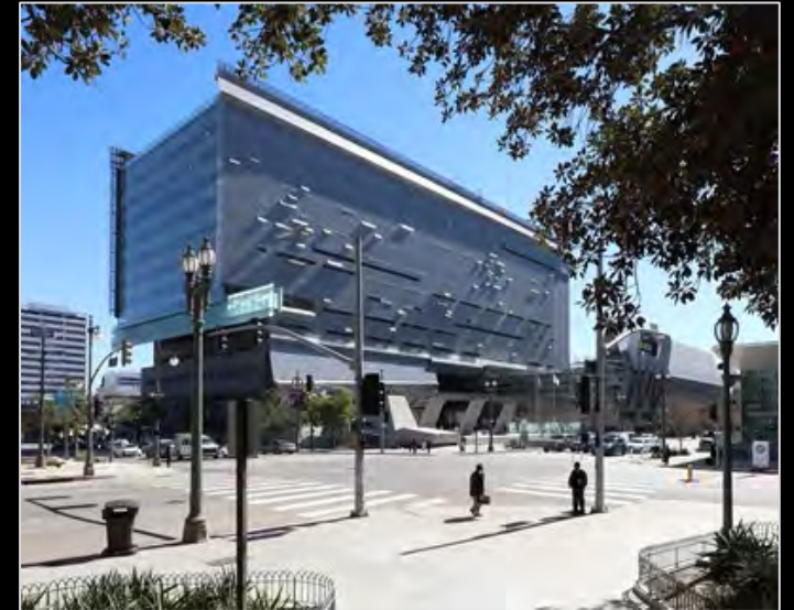
District 7, Los Angeles