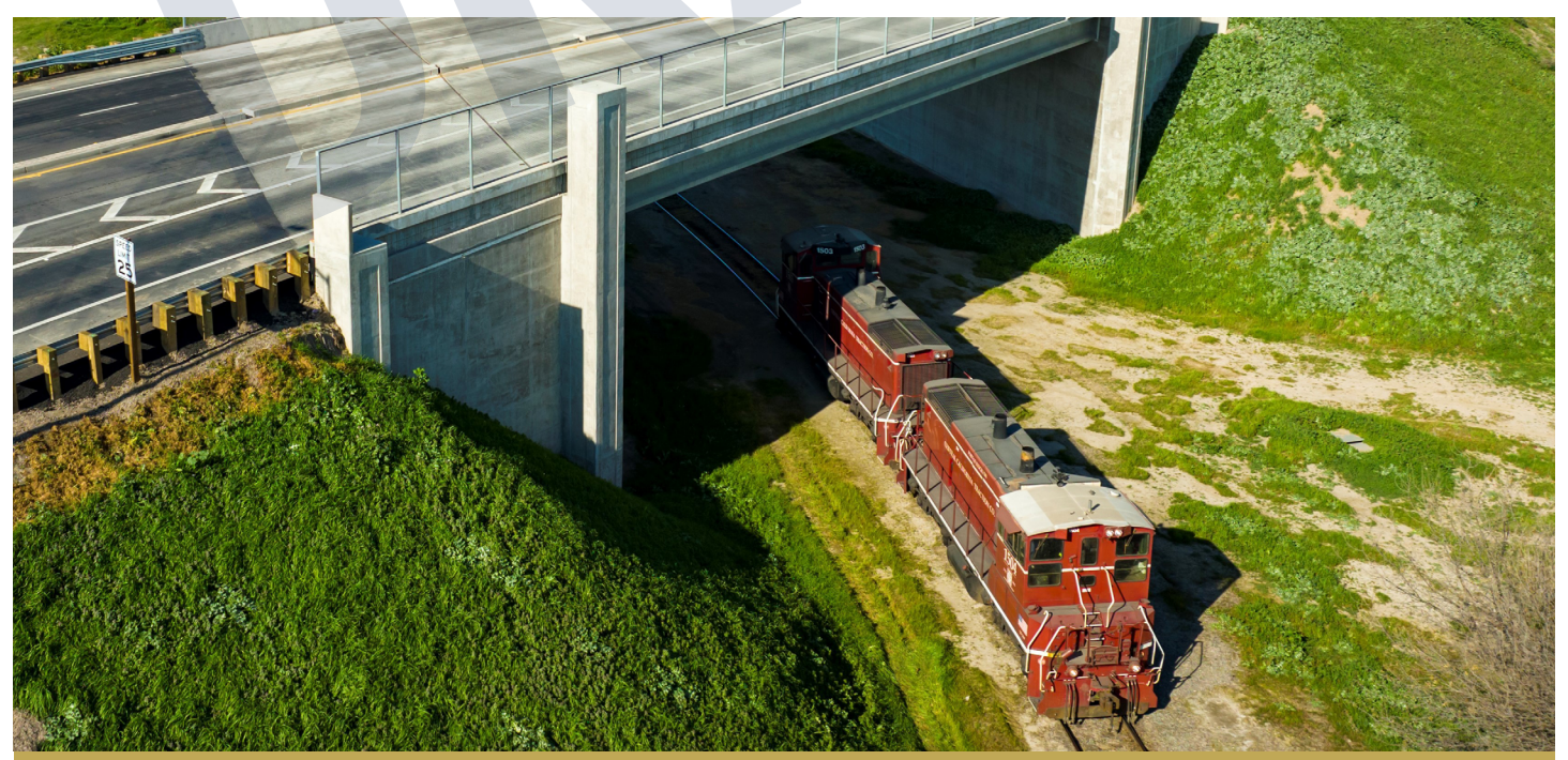
Funded through the Trade Corridor Enhancement Program, the Fyffe Avenue Grade Separation project constructed a four-lane overcrossing over the Fyffe Avenue rail line and removed an at-grade intersection. This project reduces travel times for vehicles entering the Port of Stockton, thereby facilitating the movement of goods. Removing the at-grade intersection also provides vehicle and rail safety improvements and enables a critical emergency evacuation route.

Equity-Focused Staffing and Training. The Commission requested and received funding for a position dedicated to equity in the 2022-23 budget. The Commission also hired a contractor to provide Racial Equity Training for Commissioners and select Commission staff.