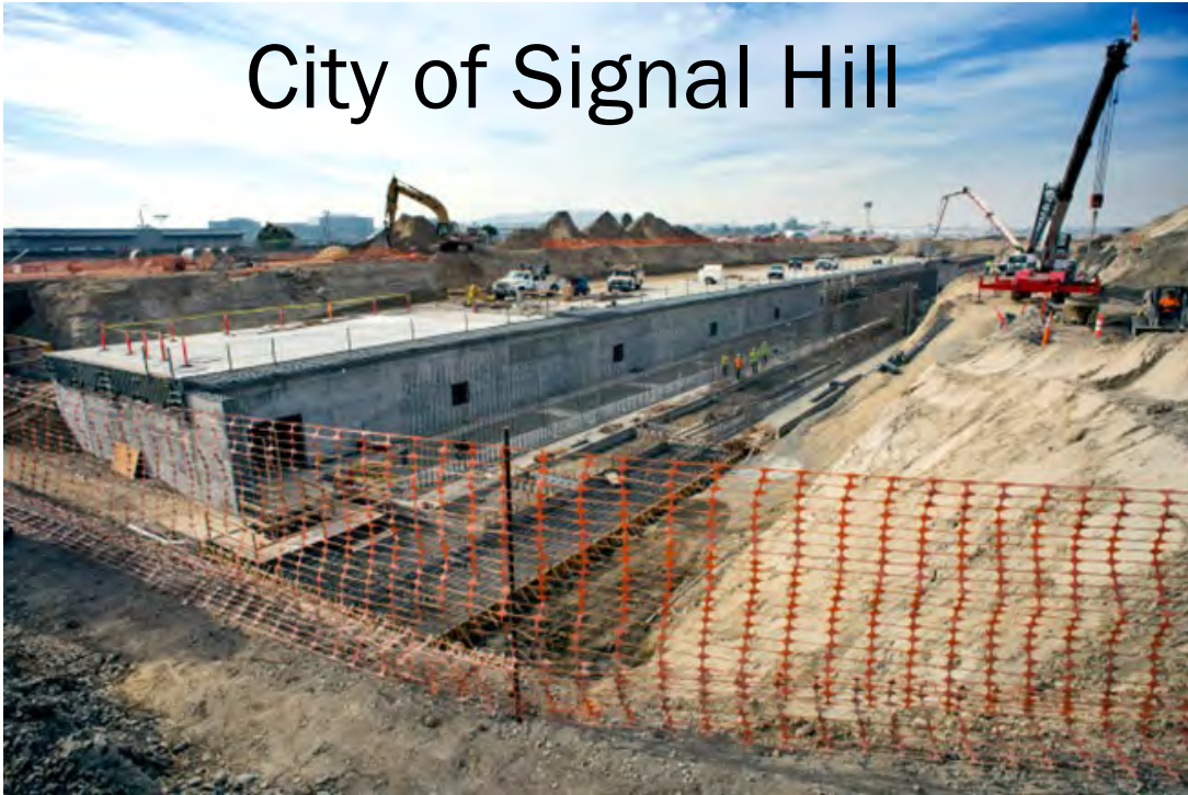
City of Signal Hill