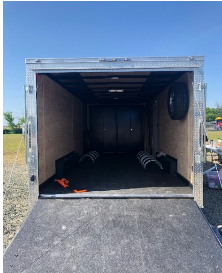
The trailer holds 15 bikes and all the gear to conduct a fun and meaningful bike rodeo

The cornerstone to the County's effort to provide sustainable active transportation education and safety awareness throughout its region was the purchase of a customized trailer to store and transport the bikes, helmets and equipment from school to school.