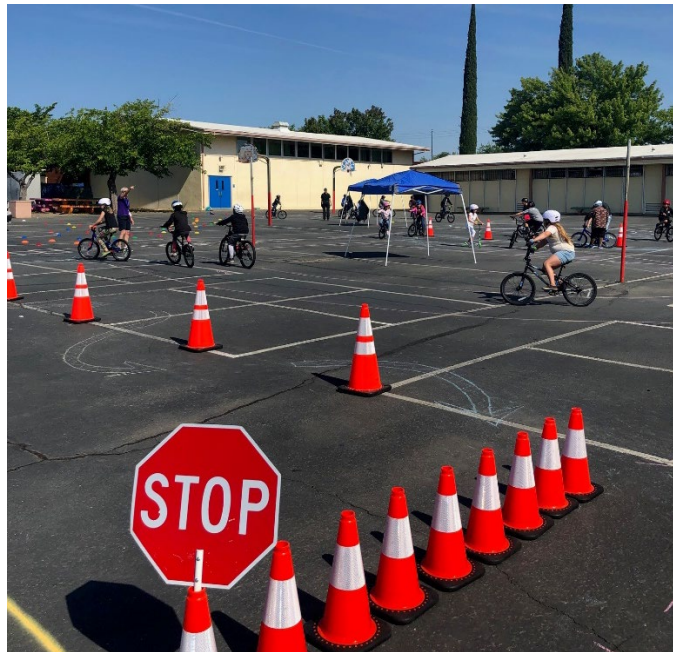
Students navigating through the bike rodeo route to practice their bike handling, safe riding and signaling skills.