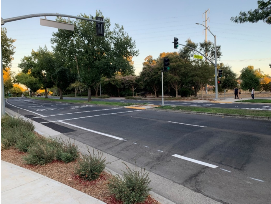
Signalized street crossing at Big Horn Blvd.