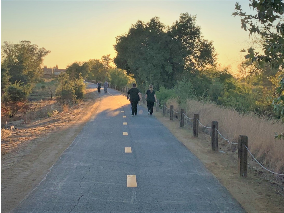
Residents enjoying an early evening walk.