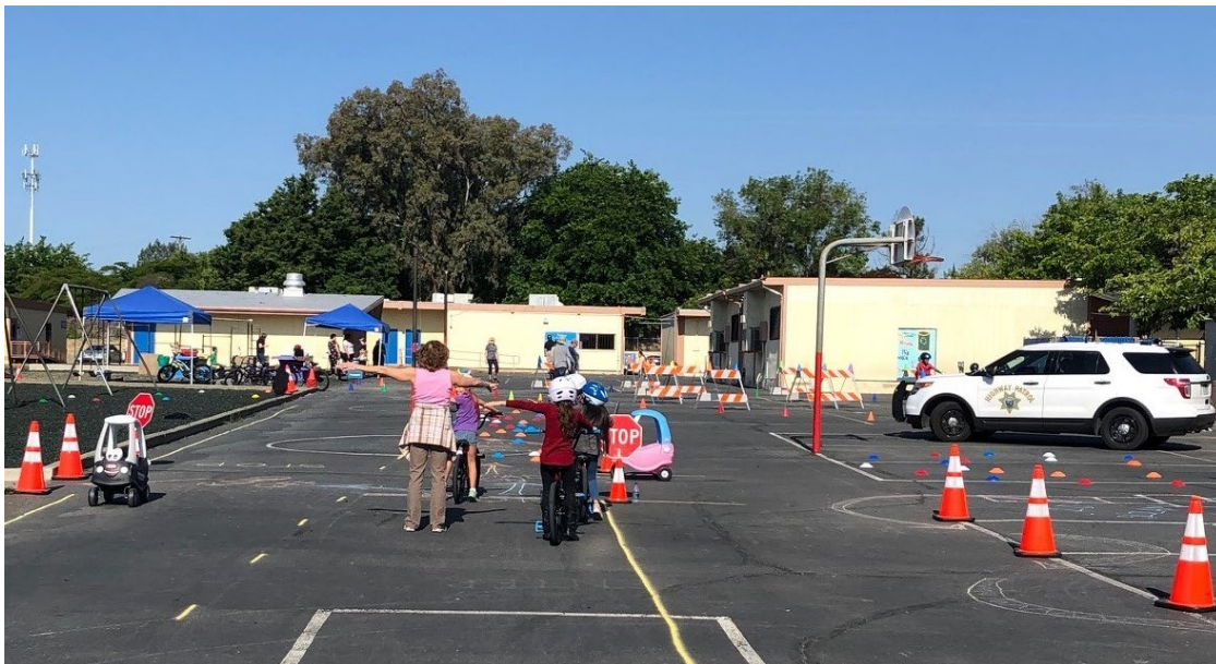
Volunteers staffed each station along the route to give instruction and assistance if needed.

In addition to County Public Health staff, volunteers included the Chico Velo Cycling Club, the California Highway Patrol, and Oakdale Heights Elementary School parents.